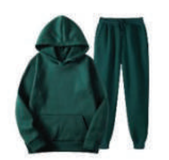
Sweet Shirts & Pants